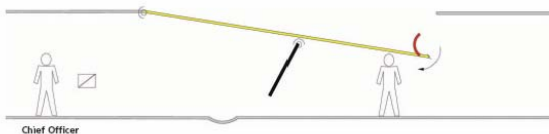
Figure 3: After a moment the rubber seal failed resulting in fatal injuries to the Cadet.

Suddenly, the rubber seal gave way and the ramp fell down on top of the Cadet (see fig.3). When tested later the ramp was working as normal.