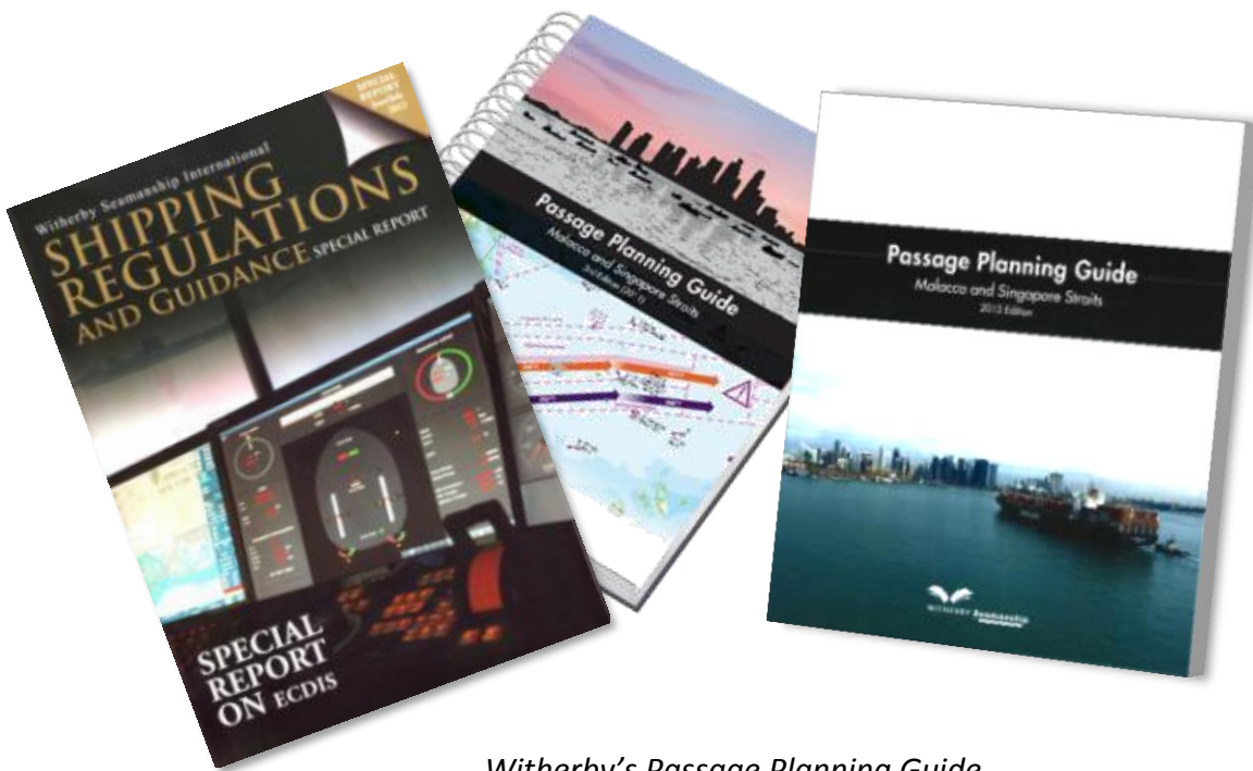
Witherby's Passage Planning Guide

More information can be obtained from StrasseLink's website : www.strasselink.com