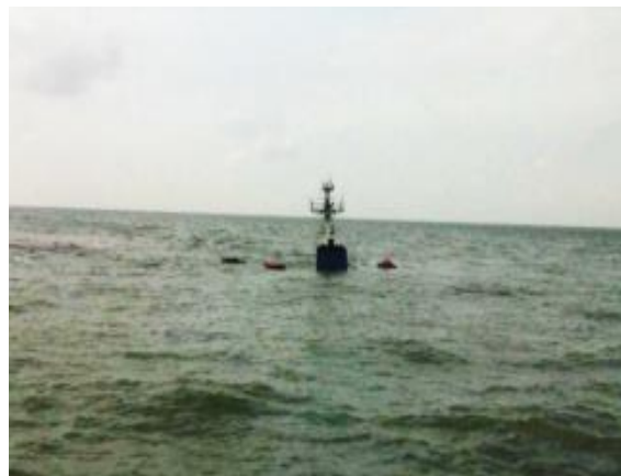
Accident between MV Xin Tai Hai and B Oceania