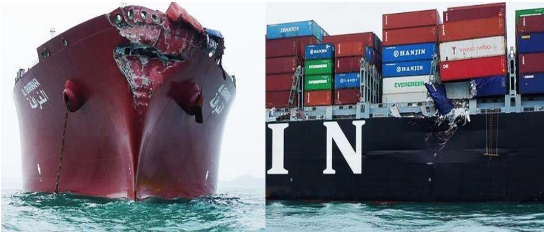
Accident between Hanjin and the Al Gharrafa

The most recent high-profile and serious collision occurred late last year occurred between the Q-Flex LNG carrier Al Gharrafa, and boxes-hip Hanjin Italy between Batam Island and Singapore.